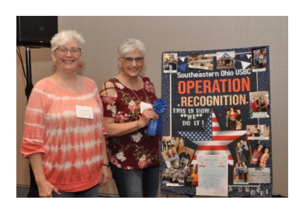
Southeastern Ohio USBC